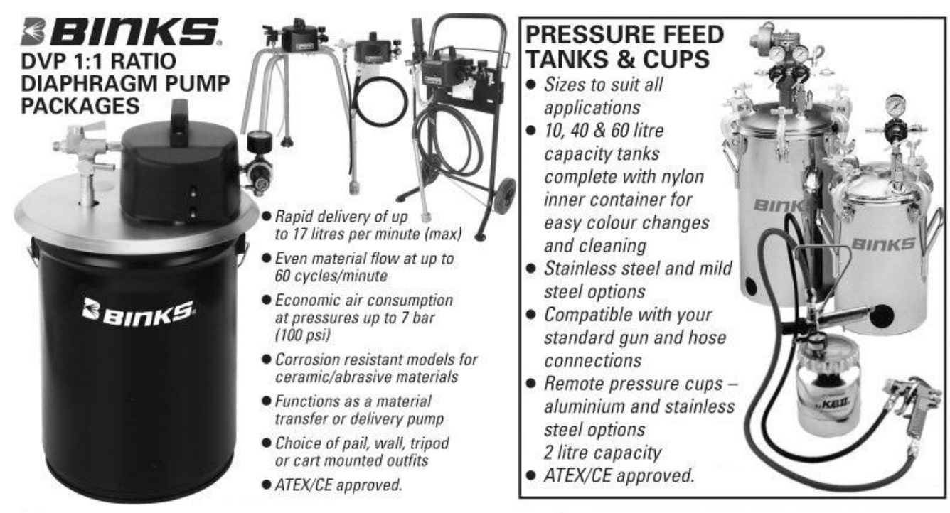
- Masters of Finishing Technology Finishing Brands UK Limited

Finishing Brands UK Limited, Ringwood Road, Bournemouth, BH11 9LH,