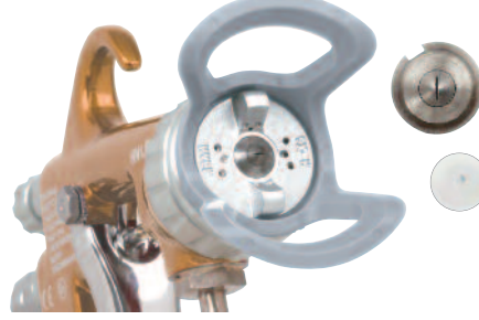
2. Fine Finish Tip Pre-orifice for best particle distribution and finish