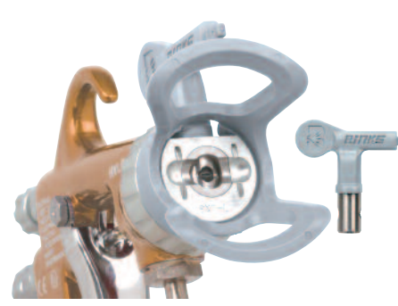
3. Twist Tip Reduces downtime caused by tip blockages