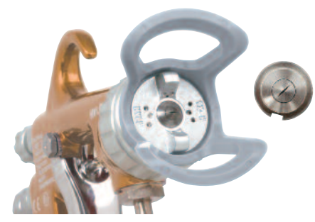
1. Flat Tip Premium tips for a uniform spray pattern